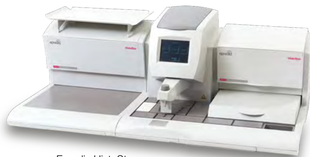
Epredia HistoStar Embedding Workstation